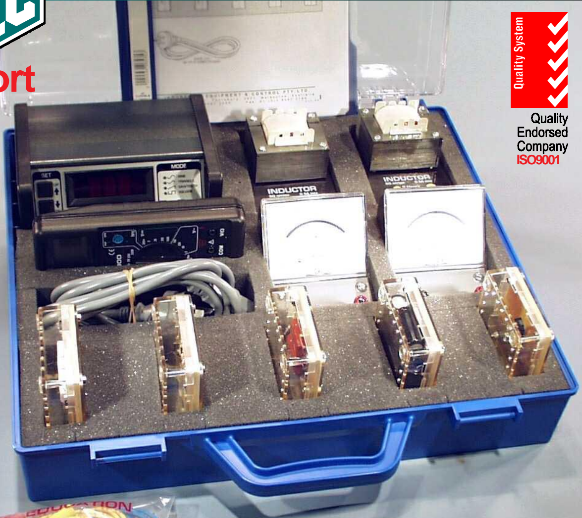
EM0060-001 A.C. Theory Kit