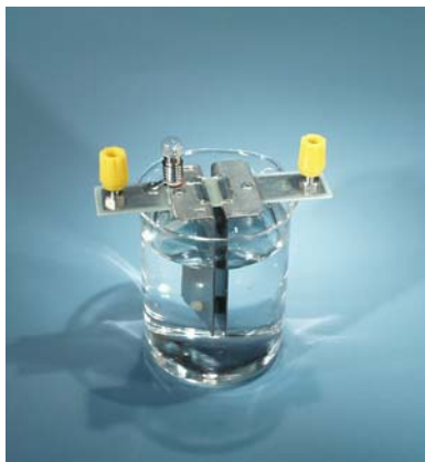
plate type, fixed gap