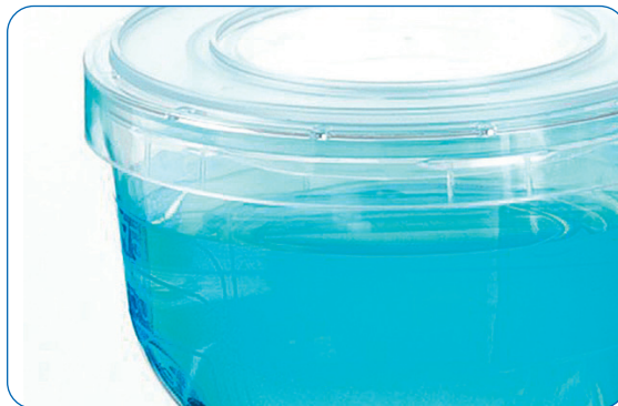
Vented lid on the device during filtration

Units can be stacked to save space in the work area