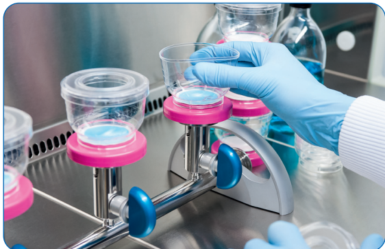
One handed funnel removal

Quick-fit connections for the vacuum tubing and a low manifold level make sterile filtration more convenient than ever before. The special filtration head for fitting the EZ-Fit® Filtration Unit allows the funnel to be removed with only one hand. The EZ-Fit® manifold's interior is easy to access for cleaning, so you can be confident that every filtration process is contamination-free. Each component can be removed by hand and autoclaved.