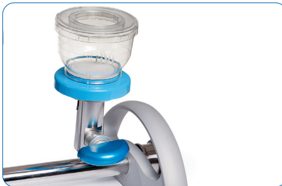
The EZ-Fit® filtration unit fits perfectly to the manifold